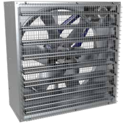
EM36 front view

As the market leader in ventilation solutions for more than 60 years, GrainProteinTech Climate Control & Air Treatment guarantees quality and is ISO 9001 certified.