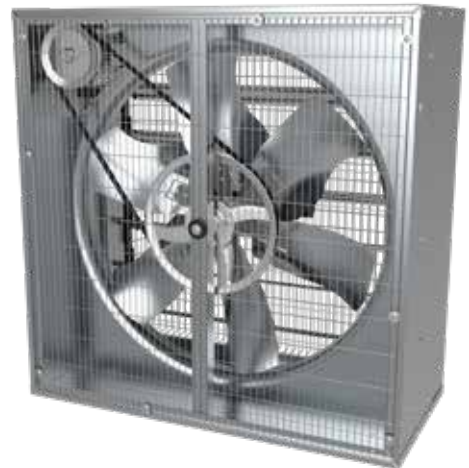
EM30 rear view